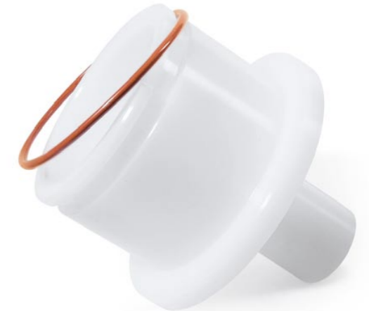
Check gauge to find out the right O-Ring.