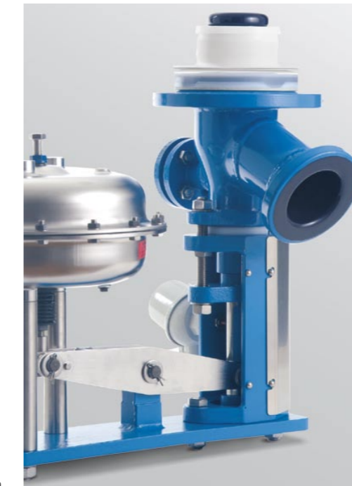
Versions: Lateral actuator for vessels with small space